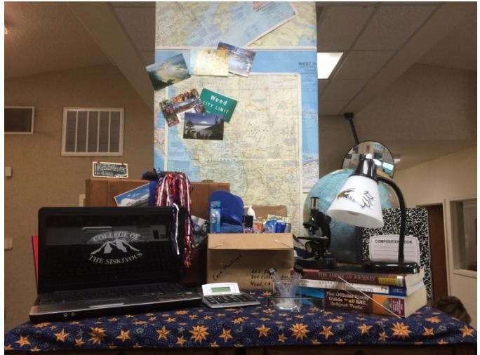
Welcome Back display in Admissions and Records/Financial Aid.