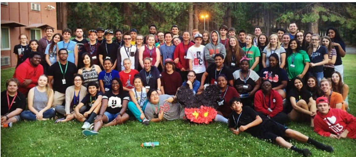
All of the Upward Bound students, RA's and freshman preview students. (The piñata in the picture was made in art class)

Upward Bound had a very successful summer with 56 students in attendance for the six-week program. The students were housed in the Lodges from Sunday through Thursday. Most of the students were enrolled in summer college classes, while others had work experience on campus or in our local community.