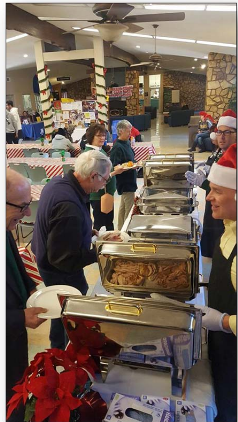
Students, employees, and even community members enjoyed a holiday meal prepared by COS Food Services and served by COS Administrators on December 6 and were also treated to entertainment by the COS Vocal Jazz Ensemble.