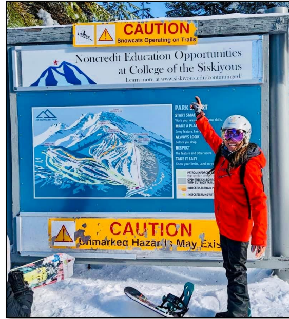
Check out our new ads at Mt. Shasta Ski Park! Featuring Noncredit, Adult Education, and CTE opportunities at College of the Siskiyous.

Stay Connected: Now that the weather has changed, it's important to make sure you are signed up for the college's communication system, "COS Connect" powered by Everbridge. This is a free system used to notify students and staff of emergency situations, campus closures, or general information. To sign up click on the COS Connect button located at the bottom of the COS homepage and follow the directions to get sign up or call the Public Relations Office for assistance.