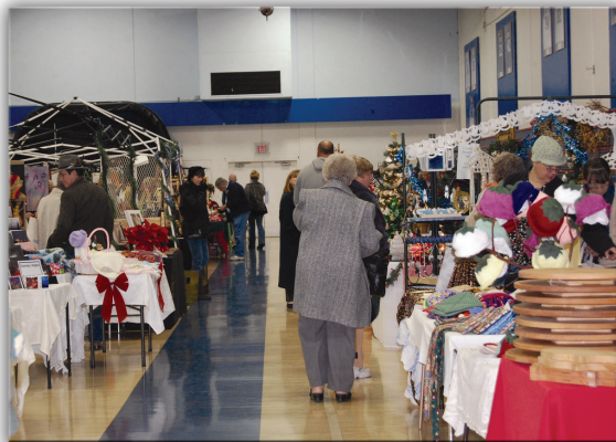
Holiday Craft Fair—December 2007