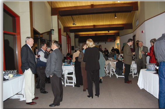
President's Gala Banquet—January 2008