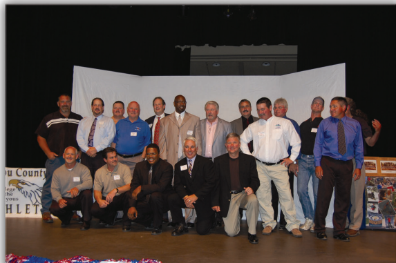
Athletic Hall of Fame—May 2008