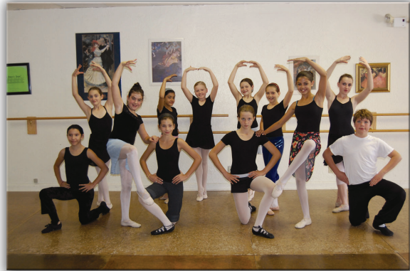
Nutcracker Auditions—September 2007