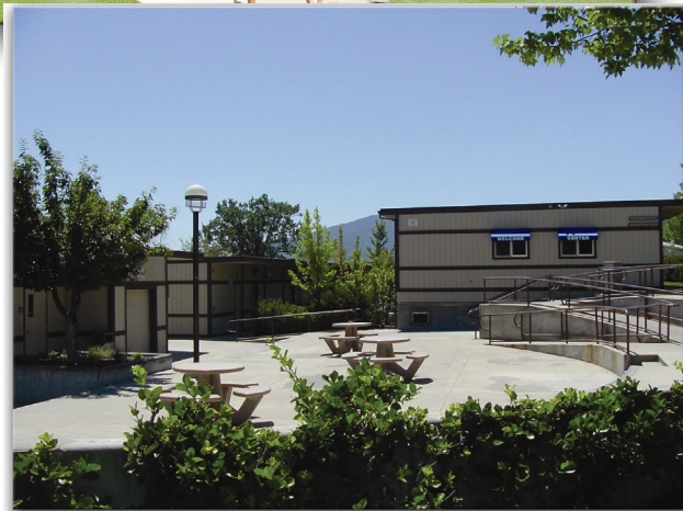
Yreka Campus Quad

College of the Siskiyous will serve our community and any student who can benefit from an exceptional learning environment which is safe, attractive and promotes a passion for learning, cultural enrichment, and sense of belonging for all.