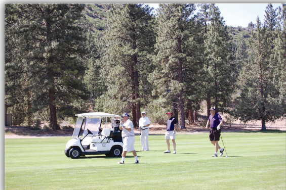
Annual Golf Tournament—June 2008