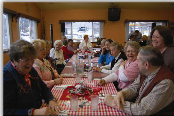
Volunteer Recognition Dinner—April 2008