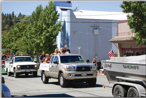
Weed Carnevale Float—July 2007