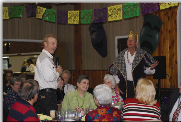
Scholarship Dinner & Auction—April 2008