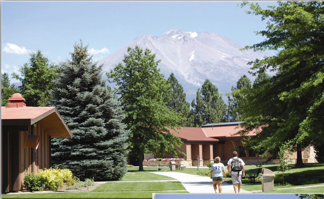
Weed Campus—Distance Learning Center