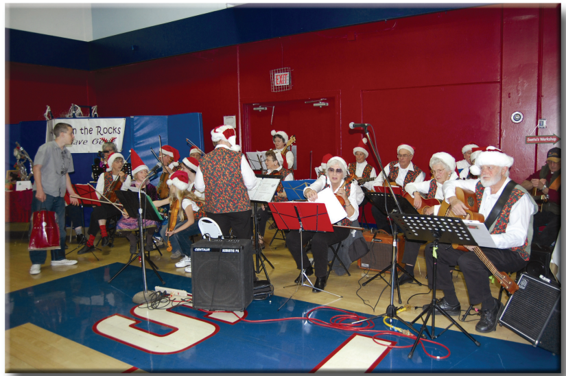
2009 Holiday Craft Fair