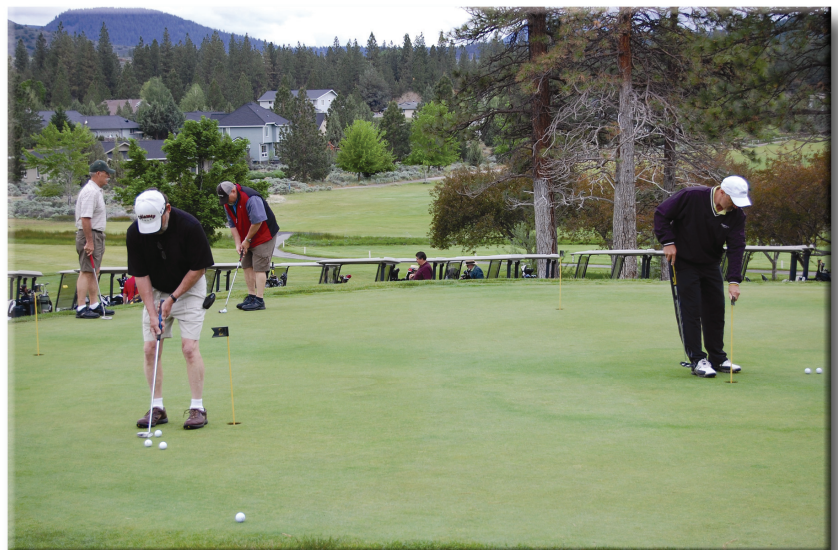
2010 Golf Tournament Lake Shastina Golf Resort