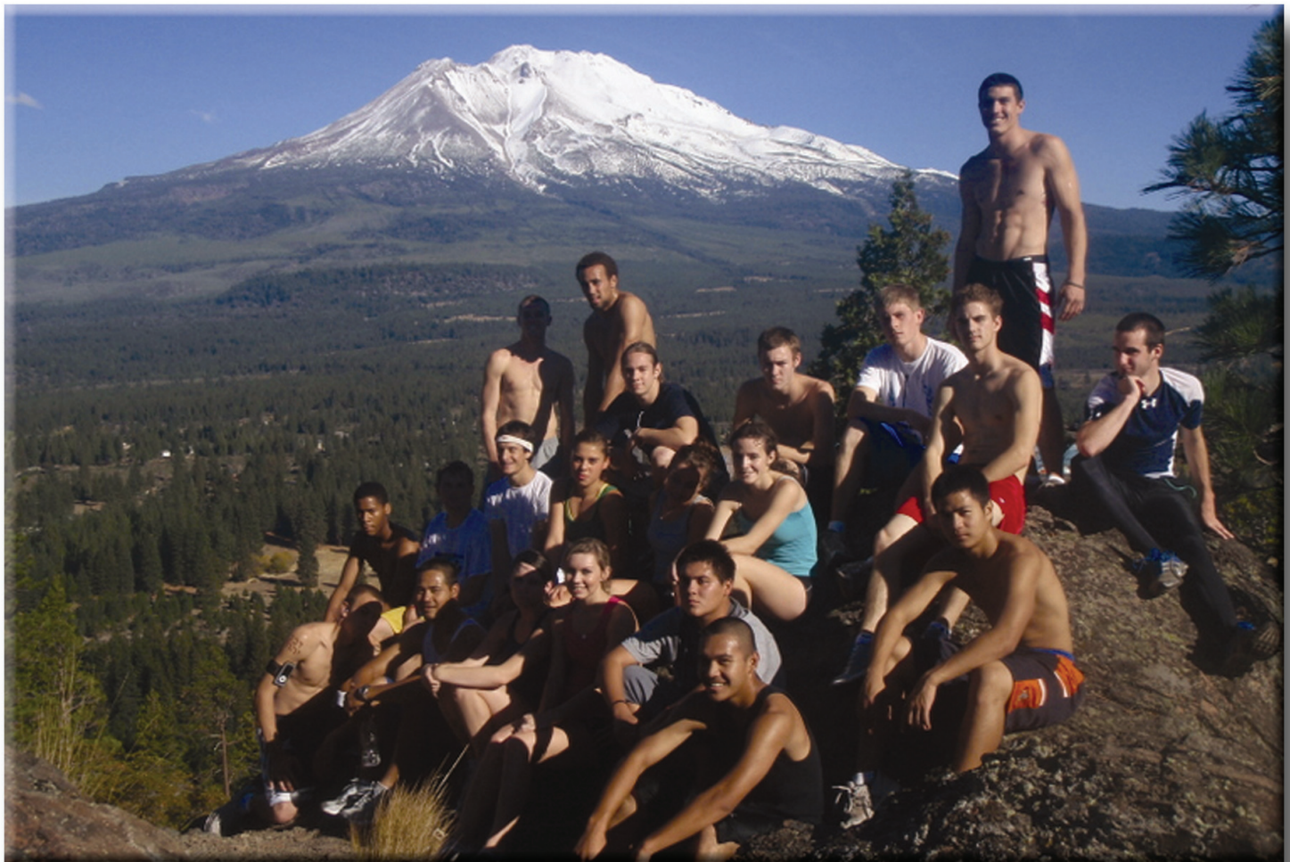
2009-2010 Members of Track Team