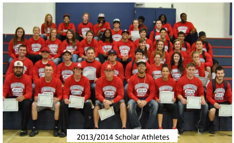
2013/2014 Scholar Athletes

Career Pathways not only provides students with specific skills and training needed in modern industries, but it also helps employers fill high-demand jobs created by the new economy. These colleges and career-ready students are what employers need to grow the regional economies of California.