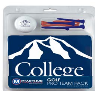
Hole- in-One Golf Set