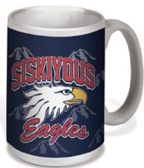
15 oz Ceramic Coffee Mug