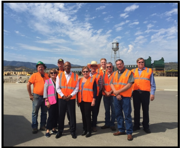
Senator Advisor Visit

Many topics were discussed that directly affect our communities here in rural Siskiyou County. Among the different topics, College of the Siskiyous was a critical component of many of the themes. The role our community college can play in areas such as strong workforce development, training for employment skills, apprenticeships, and post-secondary education is key for future survival of our industries and promoting career pathways in Career and Technical Education for the next generation.