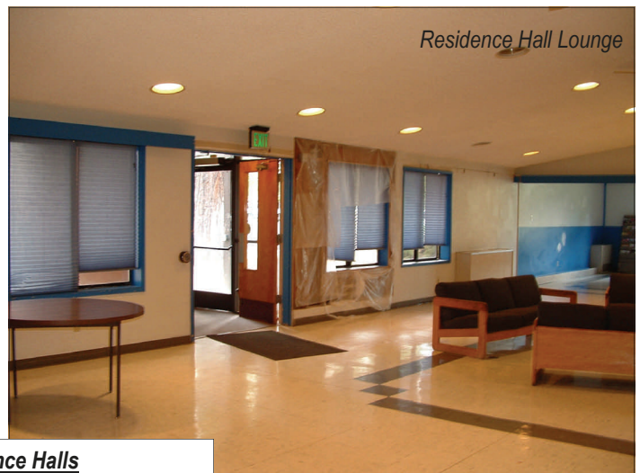
COS Residence Halls Before the remodel / renovation began May 18, 2006