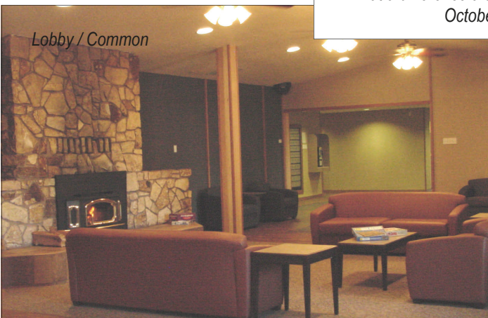
Lobby / Common