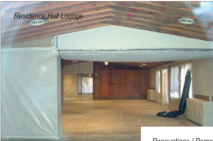
Residence Hall Lounge