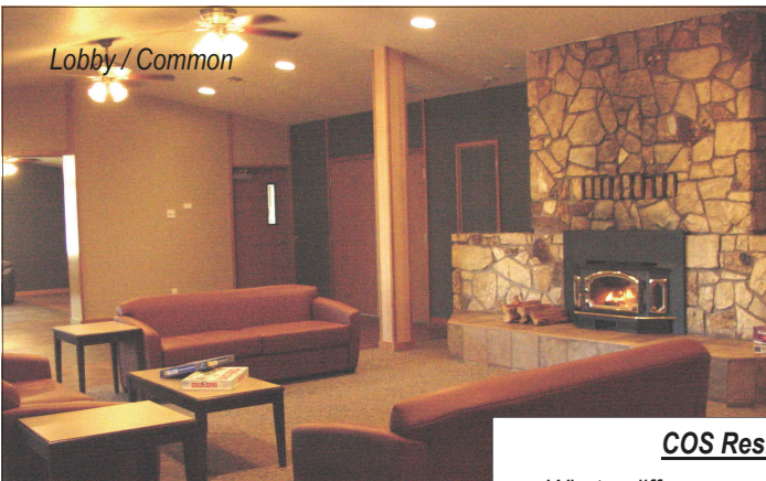
Lobby / Common