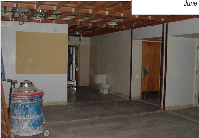
Lobby / Common