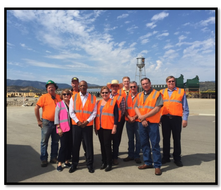
Senator Advisor Visit

Many topics were discussed that directly affect our communities here in rural Siskiyou County. Among the different topics, College of the Siskiyous was a critical component of many of the themes. The role our community college can play in areas such as strong workforce development, training for employment skills,