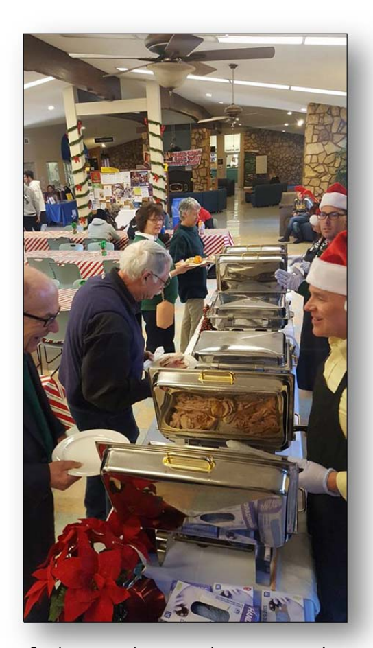
Students, employees, and even community members enjoyed a holiday meal prepared by COS Food Services and served by COS Administrators on December 6 and were also treated to entertainment by the COS Vocal Jazz Ensemble.

fighting the fires there. The evening offered a time to "dress up" in 20's attire and attend the Eagle's Nest 20<sup>th</sup> Anniversary Celebration. Recognizing how the thrift store serves to generate funds to support our students, and getting a chance to revel in this milestone was a fitting end to the day.