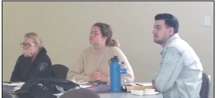
COS students participating in a group discussion

“We cannot seek achievement for ourselves and forget about progress and prosperity for our community. Our ambitions must be broad enough to include the aspirations and needs of others, for their sakes and for our own.”